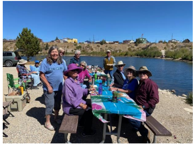
End of season picnic at Fairplay Beach