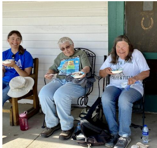
Ice cream after a long day in the field