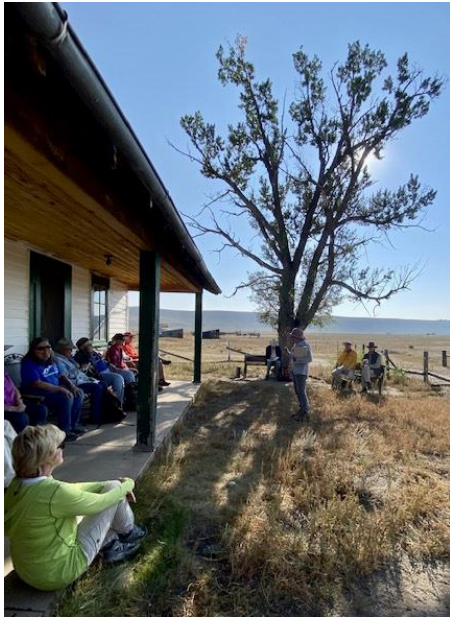
This is what we're going to do today