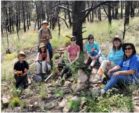
Lunch at Yellowbark Camp