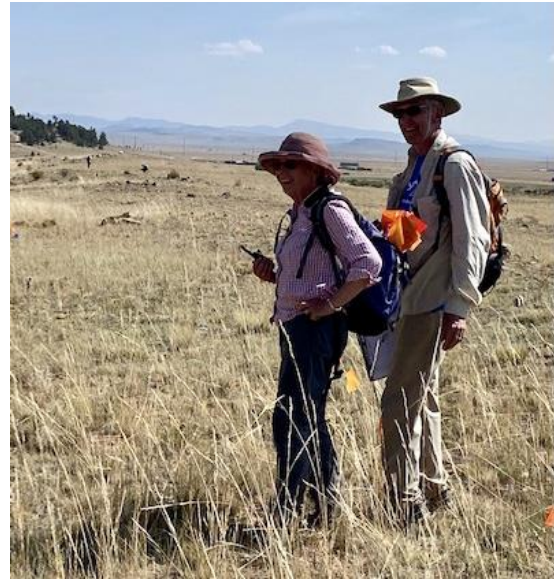
What a great site