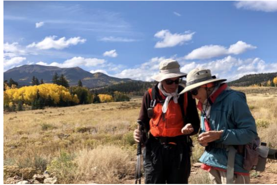
Take a look at this

Most site visits are typical with a chance to noodle around and look for other noteworthy artifacts. With the excessive and sometimes heavy rains this year, many sites experienced dense vegetation and erosion. While some known artifacts moved downhill or disappeared completely, new artifacts were uncovered and found.