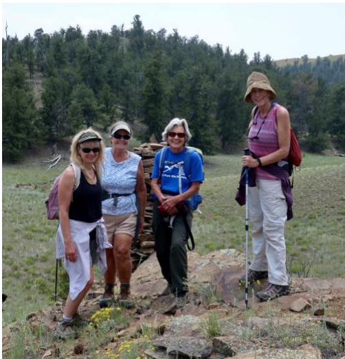
Checking out Three Mile with Paleobotanist